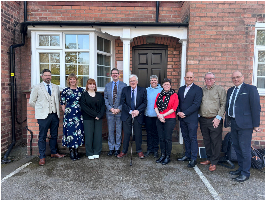
DMAG members comprising representatives from the APCC, FBCA, FSA, ICCM, NAFD, SAIF and The Cremation Society

DMAG was formed at the start of the COVID-19 pandemic and its members continue to work collaboratively to represent a united voice to Government in tackling the current challenges, in particular where these impact on bereaved families.